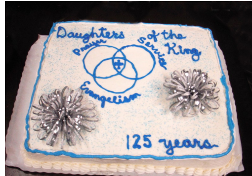
The large cake shared at coffee hour celebrating 125 years for the DOK.