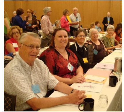
Our representatives attended the main sessions in the ballroom.

Read their comments about their experience at the Convention on page 11 of this newsletter.