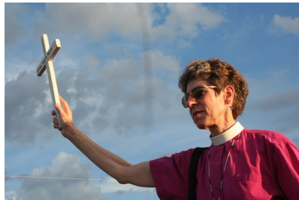
Presiding Bishop Katharine Jefferts Schori at Vigil on the Douglas, Arizona/Agua Prieta, Sonora, border.