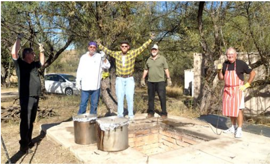
Photos from last year's BBQ. Men lift the heavy pots from the pit, where the meat has been cooking overnight. In the kitchen workers prepare the food.