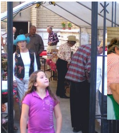
Ye Olde St. Andrew's Faire